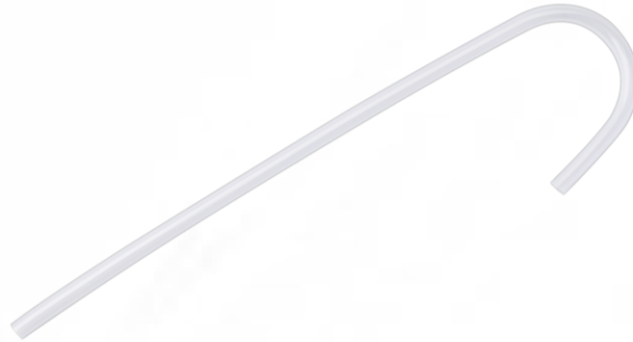
SOL001 J-tube/Quick Fill Tube