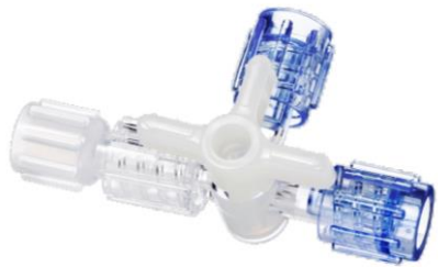
SOL002 3-way Stopcock (Male Cap closed and Female Cap open)