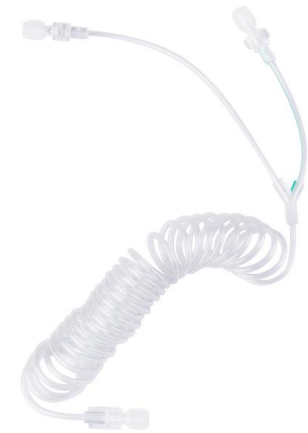
D0L180 Y Coil tube,350psi, with1 or 2 Check valves, 180cm