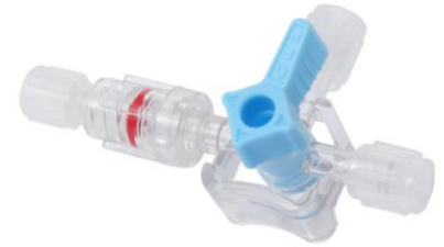
SOL004 High Pressure 3-way Stopcock (Male Cap closed and Female Cap open )