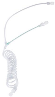
D0L150 Y Coil tube,350psi with1 or 2 Check valves ,150cm