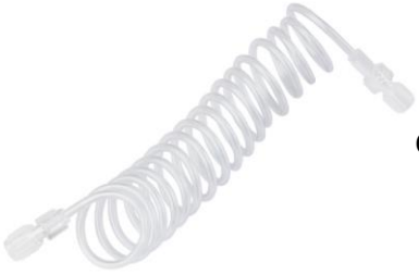
SOL150 Coil tube,350psi ,150cm with 1 Checkvalve